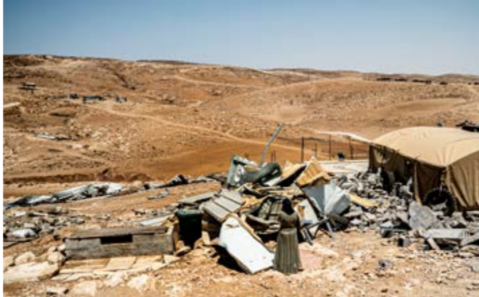
Demolished shelter in Masafer Yatta, West Bank, Occupied Palestinian Territories.

According to UN Office for the Coordination of Humanitarian Affairs (OCHA), of the injuries recorded across the West Bank since 7 October, 33% of those have been caused by live ammunition, compared with 9% in the first nine months of 2023, indicating a stark shift in tactics. 26 MSF patients in H2 shared stories of soldiers shooting with live ammunition at young men and houses as well. One patient reported, “they aim weapons at us immediately as we open the house door.” Another patient shared, “there was a young man crossing the road, so the soldiers attacked him, and when my nephew went to defend him, the soldiers tried to shoot my nephew.”