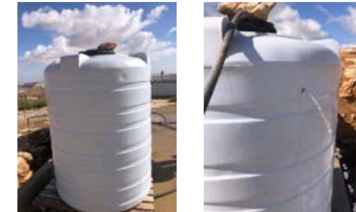
Water tanks with bullet holes, caused by settlers shooting at homes, herd, and water tanks, according to the community.

As reflected in the data on the escalating violence in the West bank (Table 1) and supported by testimonies from MSF's patients, Palestinians in Hebron Governorate—men, women, children, and elderly—are exposed to more frequent and intense physical violence, have reduced access to medical care, are forced to change their health-seeking behaviours. They are left no choice but to adapt their diet due to financial hardship, and have reduced access to potable water—all factors that are known to negatively impact physical health.