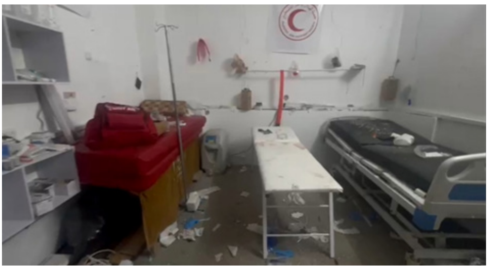
Damage done to the stabilisation point in Nur Shams camp, Tulkarem, following an Israeli incursion on 16-17 December 2023.